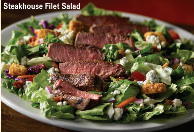
Steakhouse Filet Salad