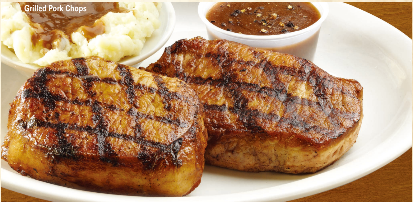
Grilled Pork Chops

Tender, slow-cooked pork covered in our signature barbeque sauce and served with our toasted fresh-baked bread ..... 14.49