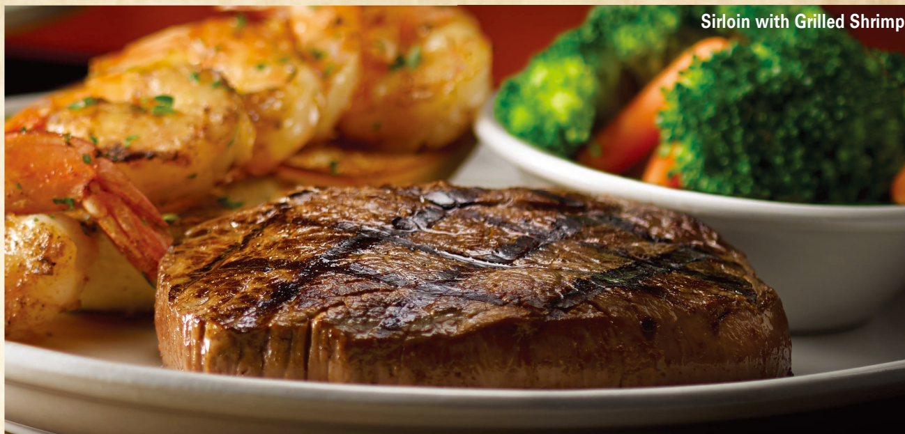
Sirloin with Grilled Shrimp

Served with your choice of two made-from-scratch sides.