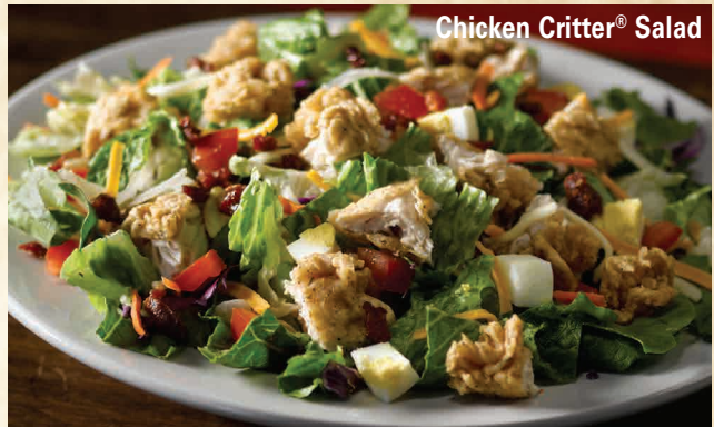
Chicken Critter® Salad

Crisp cold greens, strips of marinated chicken, freshly shredded cheddar cheese, chopped egg, diced tomato, bacon, red onions and made-from-scratch croutons ..... 13.99