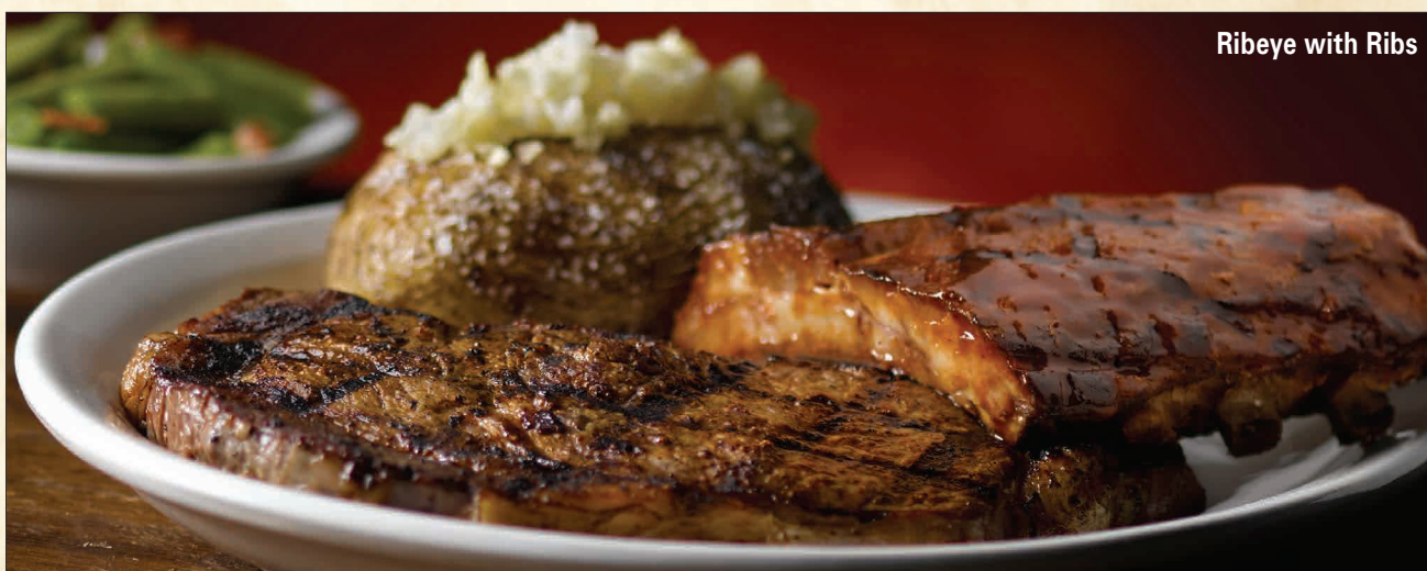
Ribeye with Ribs