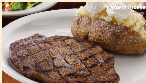
Ft. Worth Ribeye