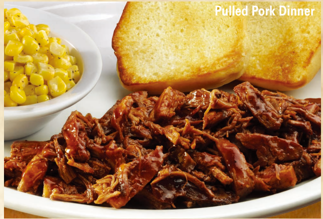
Pulled Pork Dinner

Tender pieces of sirloin with sautéed mushrooms and onions in a made-from-scratch brown gravy, served with seasoned rice or mashed potatoes and your choice of one made-from-scratch side ..... 16.49