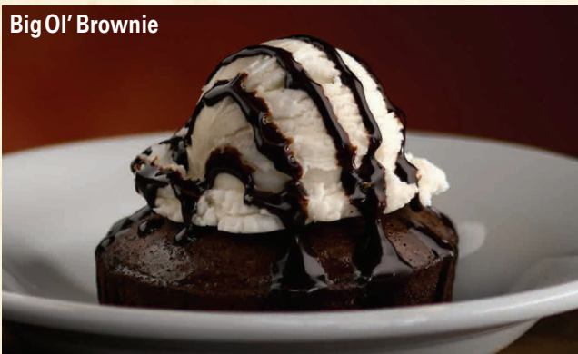
Big Ol' Brownie