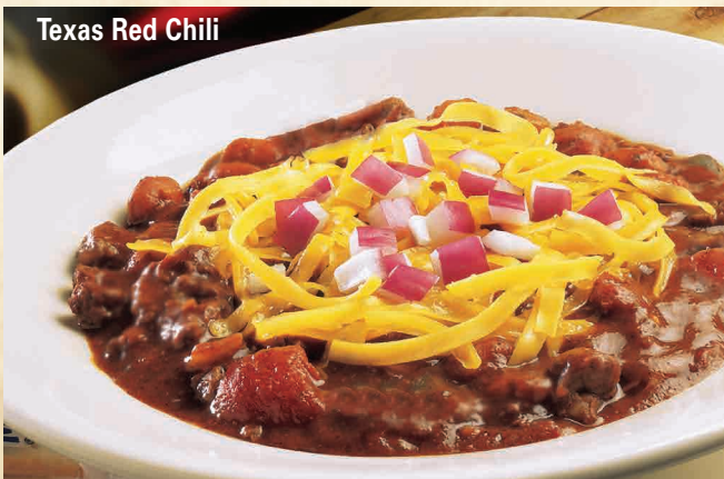
Texas Red Chili