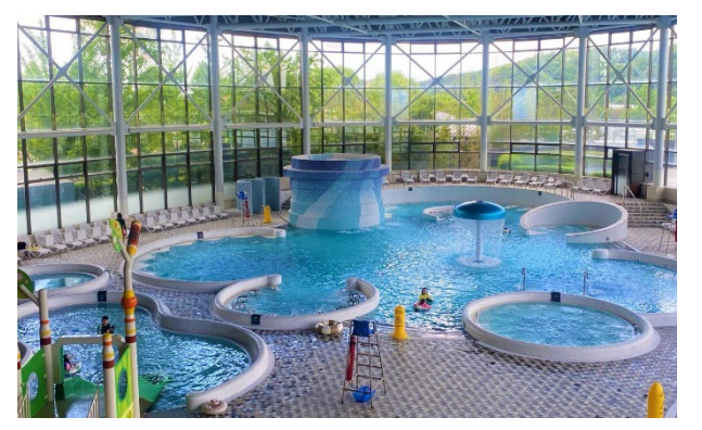
Indoor Bade Pool

• You must be 120cm(3.93ft) tall or more