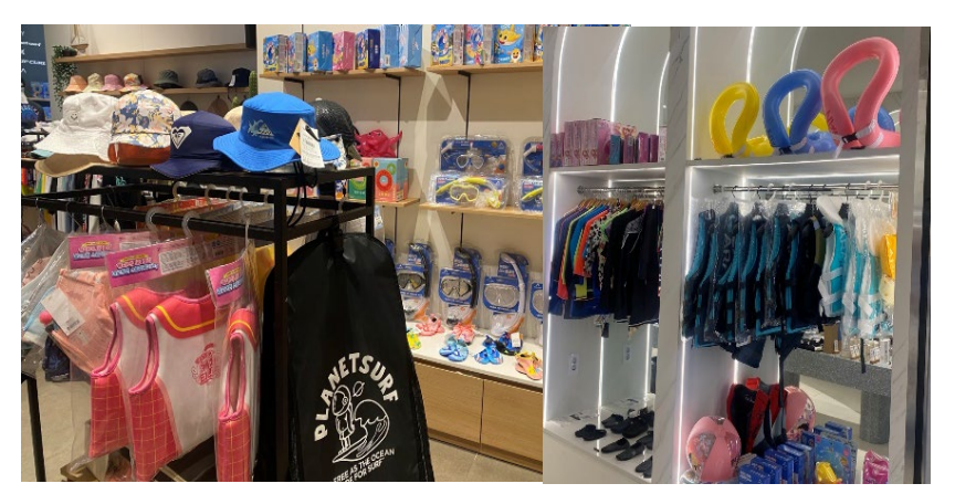
Aqua shop - lobby