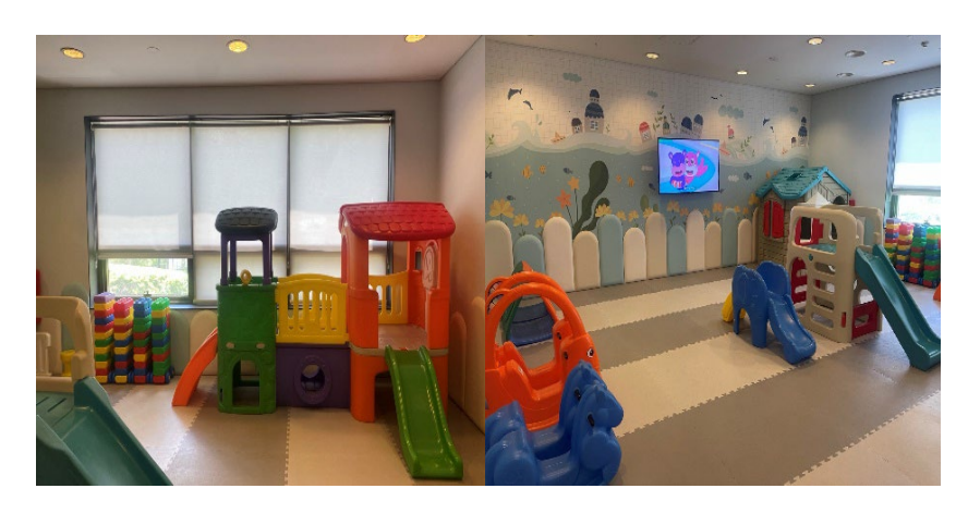
Kids Play Zone

* Free admission for Dogo Paradise Customer