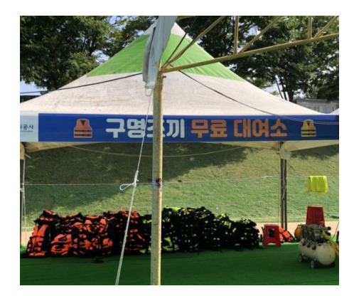
Life jacket rental station *free