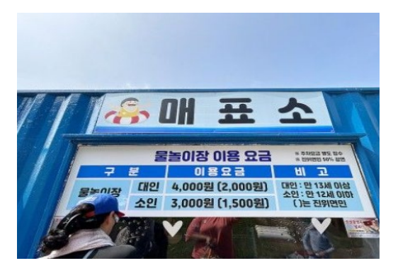
4. Pay entrance fee in the ticket booth