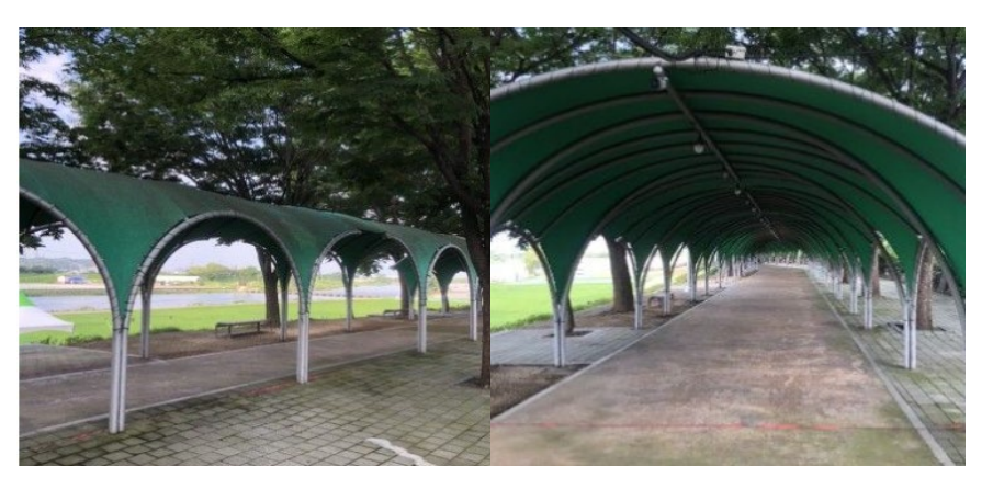
In this area, you can lay down a mat and have a meal