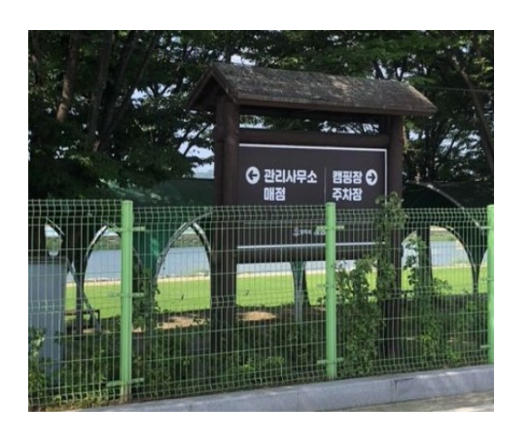
2. When you see the sign, go right side