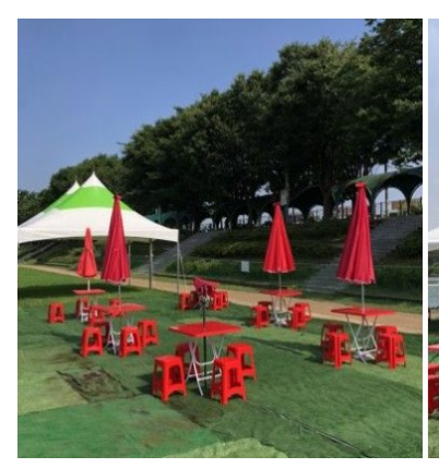
Shelter * Food is not allowed