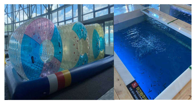
Water ball / Doctor fish experience (Inside pool)