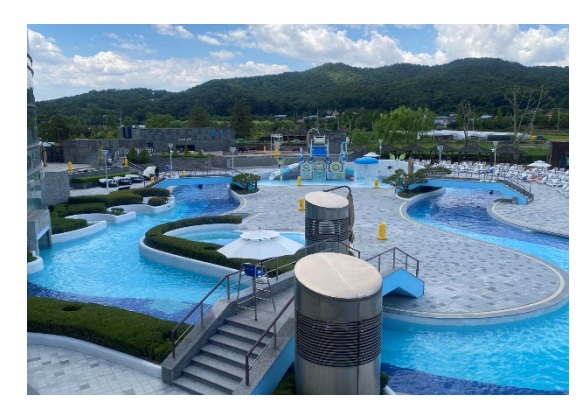
Outdoor Lazy River

• You must be 120cm(3.93ft) tall or more